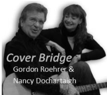
Enjoy a musical evening with duo Cover Bridge on Thursday, October 19 th at 7 p.m.