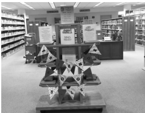
The Friends of the Montvale Library were recently honored with a mobile book display highlighting their many contributions.